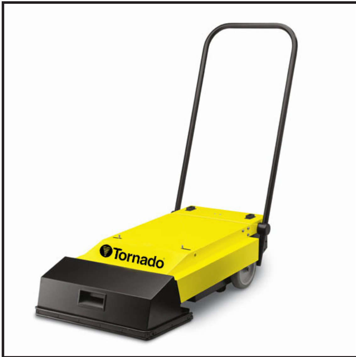
BR 460 ESCALATOR CLEANER MODEL NO: 96180